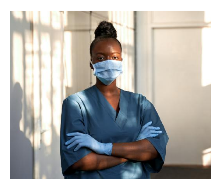
Join the #WhylCare Campaign

Join the AHCA and NCAL in their #WhylCare campaign as they showcase video stories of individuals in long-term care sharing their passion behind their work and why they do what they do.