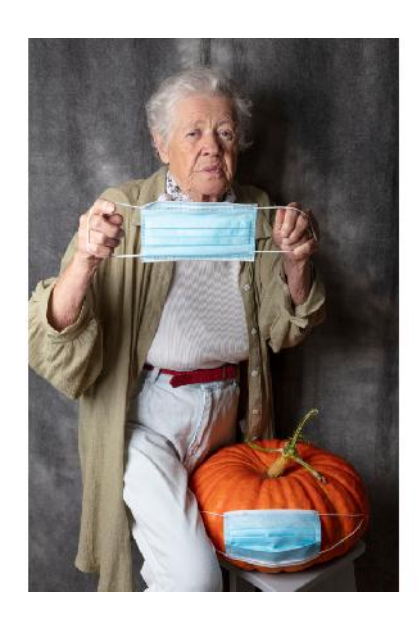
Happy, Healthy, and SAFE Halloween Tips (infographic)

Preparing for Halloween? Ensure a happy, healthy, and safe Halloween celebration with your residents and staff by checking out some of these helpful Halloween safety tips that fit the environment of this Fall season!